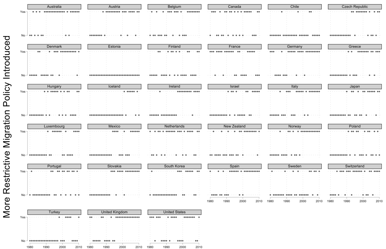
Figure 1. Implementation Migration Policies

control on migrants at the border or within the territory. For the purpose of our analysis, we opt for a dichotomous coding that receives the value of 1 if at least one, more restrictive immigration policy measure has been implemented in a given country-year (0 otherwise). The coding of migration policies' restrictiveness is difficult due to complex coding criteria. Aggregating and recoding the implementation of more restrictive migration policy into a binary variable has the advantage to mitigate this issue by reducing the risk of coding error. That said, the appendix considers alternative specifications.