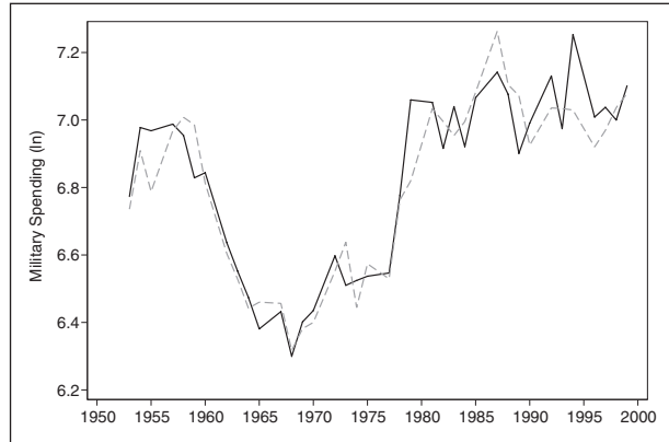
Figure 2. Median levels of military spending: predicted (dashed line) and actual (solid line) values.

smaller than 1 indicate that the “theoretically informed model” performs better than the naive specification. For our baseline model, the MPSE is 0.0879, while Theil’s U is at 0.9643. Ultimately, therefore, the specifications used in Model 3 perform well in predicting military spending.